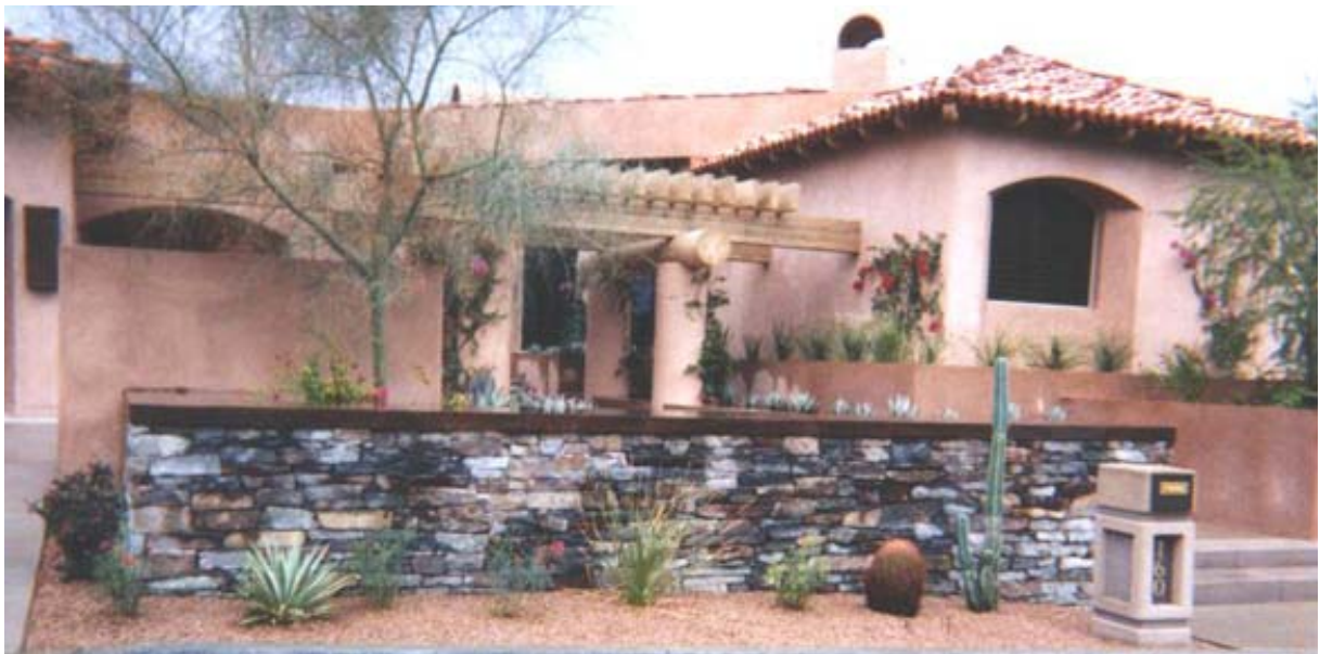
Hathaway Stone Rustic Ledge (above) #HRL25