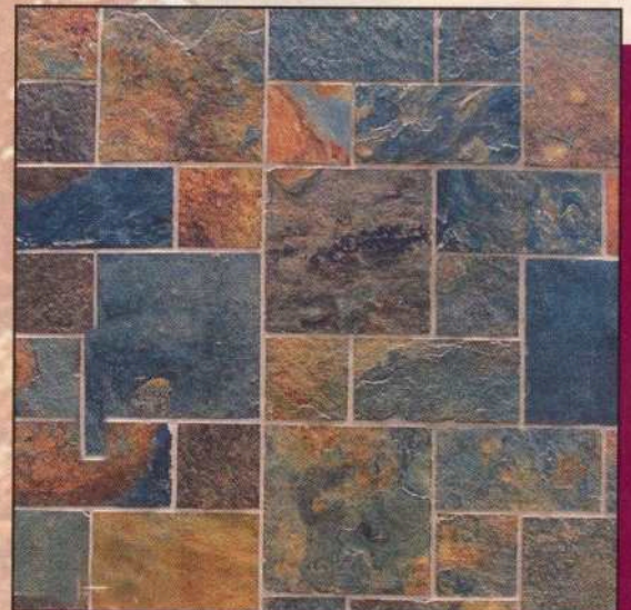
CHARCOAL TERRA COTTA