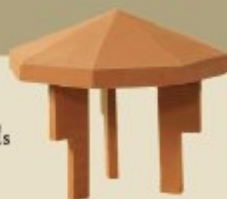
Octagonal From 8" to 13"

Rain guards are available for just about any style of chimney pot. Round rain guards are used with chimney pots that have a round top opening and square rain guards are available for chimney pots or flues with a square top opening.