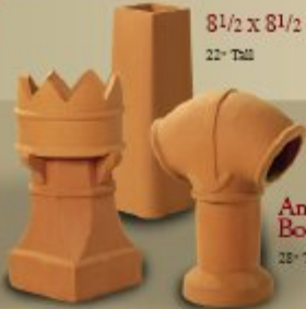
Anchor Bonnet ●