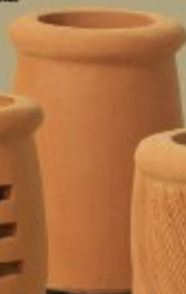
Mini Windsor ●