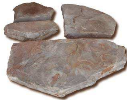
East Sierra Thin Flagstone