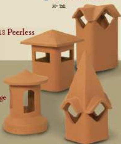
18 x 18 Peerless ○