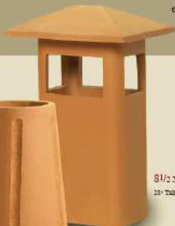
8 1/2 x 13 Peerless ● 28" Tall