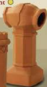
8 1/2 x 8 1/2 Classic ○