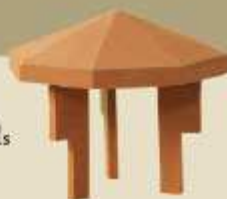
Octagonal From 8" to 13"

Rain guards are available for just about any style of chimney pot. Round rain guards are used with chimney pots that have a round top opening and square rain guards are available for chimney pots or flues with a square top opening.