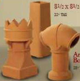
Anchor Bonnet ●