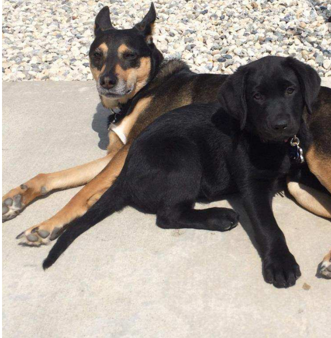
Bonding Time with Skyler....Life is good over here!